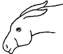
Ears flat back - I might be cross. Go away.