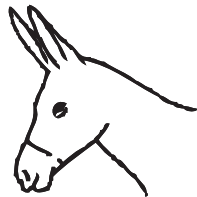
Alert and interested