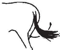
Swishing tail - I am warning you to not come any closer.