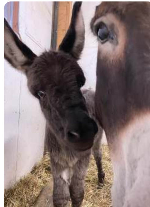
Baby Pepper with mom Brie, shortly after arrival to the DSC

2021 was challenging with pandemic restrictions in effect for much of the year. Our education program focuses on visitors and in-person visits so restrictions forced us to be more creative in the way we assist stakeholders. The outreach program shifted to include more virtual assistance and our humane education shifted to digital education.