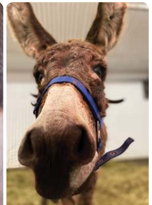
A close-up visit with Salsa